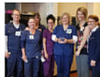
L to R: Virginia Mason; CHI Franciscan St. Anthony Hospital; MultiCare Deaconess Hospital; Rosebud Health Care Center; Daniels Memorial Healthcare; Kootenai Health; St. Peter's Health; Mat-Su Regional Medical Center; Confluence Health, Central Washington Hospital; Providence St.